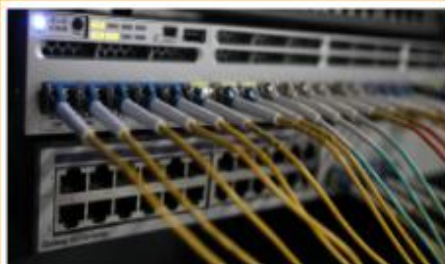
Cisco Catalyst 3850

Our test equipment: VOLKTEK MEN-4110, HP 2530-8G, CRS226-24G-25+RM, Catalyst 2960G Series, Catalyst 3850 XS 10G SFP+, Catalyst 3750-E Series, HUAWEI S5700Series, H3C S3100V2 Series, Juniper-EX4200, etc.