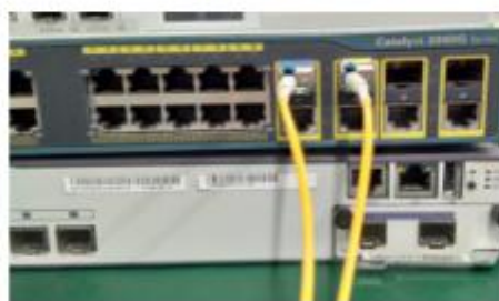
Cisco Catalyst 2960G