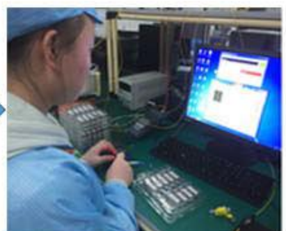
Product Final Test