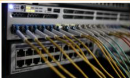
Cisco Catalyst 3850

Our test equipment: VOLKTEK MEN-4110, HP 2530-8G, CRS226-24G-25+RM, Catalyst 2960G Series, Catalyst 3850 XS 10G SFP+, Catalyst 3750-E Series, HUAWEI S5700Series, H3C S3100V2 Series,Juniper-EX4200, etc.