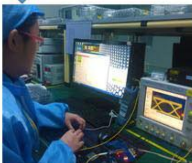
Product Initial Test