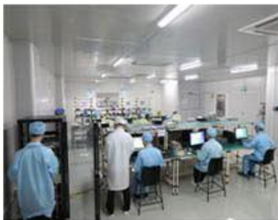
Standardized Production Line

Continuous introduction of new equipment, produced by strict standards, strict quality inspection, to guarantee the high quality standard of each product.