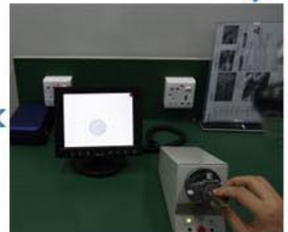
Cleaning end face