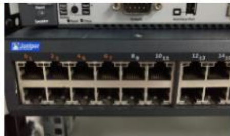
Juniper EX 4200