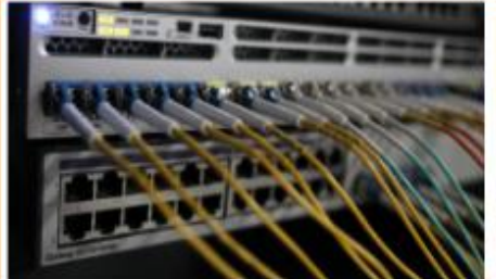
Cisco Catalyst 3850

Our test equipment: VOLKTEK MEN-4110, HP 2530-8G, CRS226-24G-25+RM, Catalyst 2960G Series, Catalyst 3850 XS 10G SFP+, Catalyst 3750-E Series, HUAWEI S5700Series, H3C S3100V2 Series, Juniper-EX4200, etc.